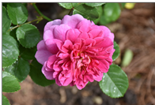
Zephirine Drouhin Climbing Rose flowers