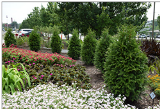
Junior Giant Arborvitae

Junior Giant Arborvitae will grow to be about 20 feet tall at maturity, with a spread of 8 feet. It has a low canopy, and is suitable for planting under power lines. It grows at a medium rate, and under ideal conditions can be expected to live for 50 years or more.