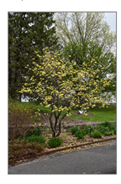
Butterflies Magnolia in bloom