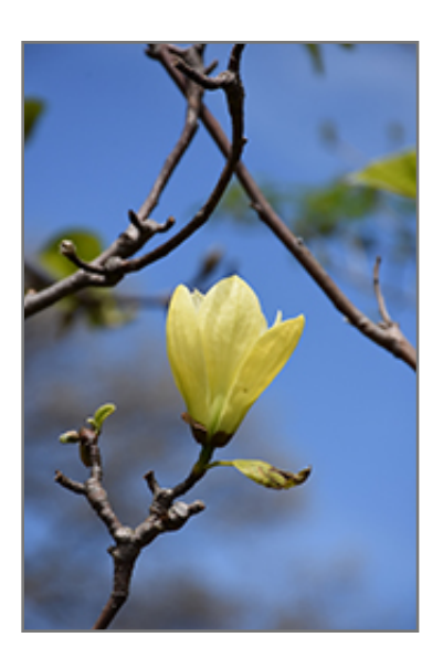
Butterflies Magnolia flowers

This tree does best in full sun to partial shade. It requires an evenly moist well-drained soil for optimal growth, but will die in standing water. It is not particular as to soil type, but has a definite preference for acidic soils. It is quite intolerant of urban pollution, therefore inner city or urban streetside plantings are best avoided. Consider applying a thick mulch around the root zone in winter to protect it in exposed locations or colder microclimates. This particular variety is an interspecific hybrid.