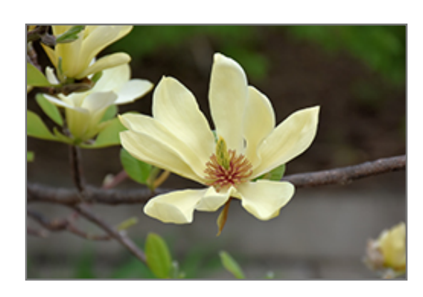
Butterflies Magnolia flowers