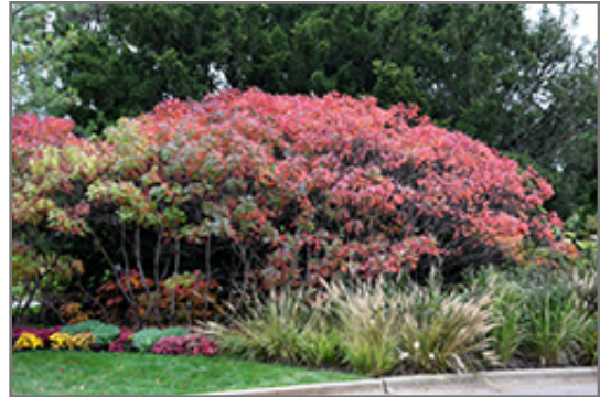
Prairie Flame Shining Sumac in fall

This shrub does best in full sun to partial shade. It is very adaptable to both dry and moist growing conditions, but will not tolerate any standing water. It is not particular as to soil type or pH. It is highly tolerant of urban pollution and will even thrive in inner city environments. This is a selection of a native North American species.