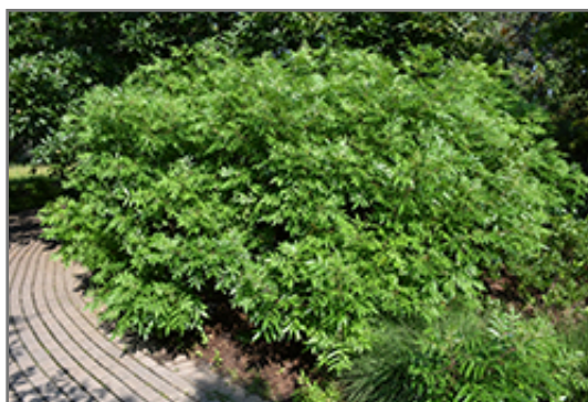
Prairie Flame Shining Sumac