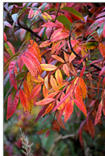
Prairie Flame Shining Sumac in fall