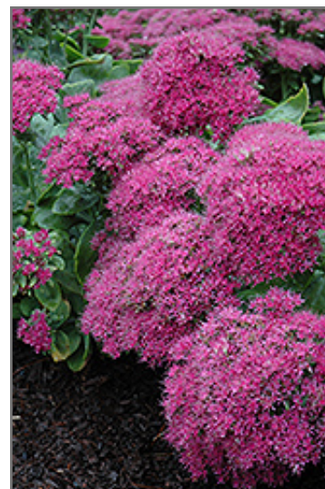
Neon Stonecrop flowers

Neon Stonecrop is a dense herbaceous perennial with an upright spreading habit of growth. Its relatively coarse texture can be used to stand it apart from other garden plants with finer foliage.