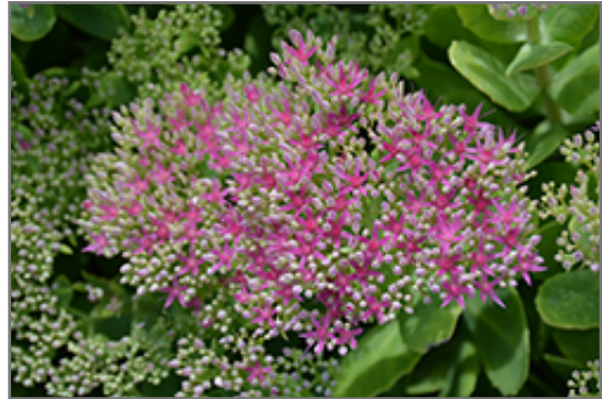
Neon Stonecrop flower buds