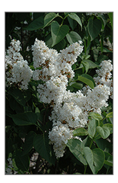
Fiala Remembrance Lilac flowers

A recently introduced lilac with exquisitely fragrant double white blooms emerging from creamy buds; upright, multi-stemmed habit, very hardy, tends to sucker, ideal for screening; full sun and well-drained soil, allow room for air movement