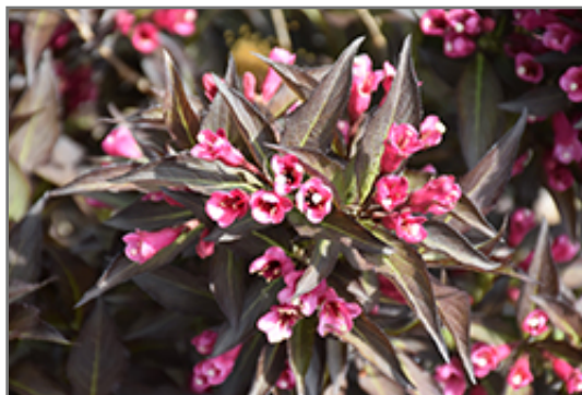
Midnight Wine Weigela flowers