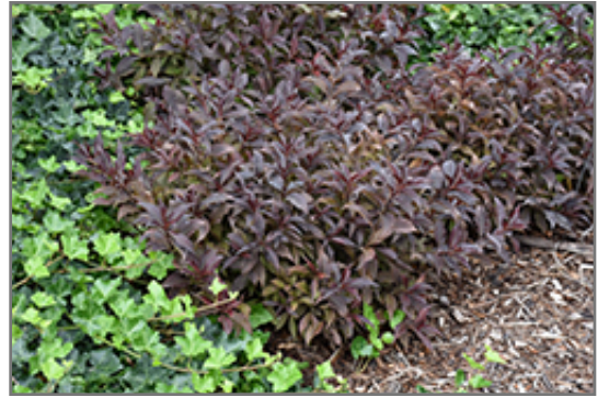
Midnight Wine Weigela

Midnight Wine Weigela makes a fine choice for the outdoor landscape, but it is also well-suited for use in outdoor pots and containers. It is often used as a 'filler' in the 'spiller-thriller-filler' container combination, providing a mass of flowers and foliage against which the thriller plants stand out. Note that when grown in a container, it may not perform exactly as indicated on the tag - this is to be expected. Also note that when growing plants in outdoor containers and baskets, they may require more frequent waterings than they would in the yard or garden.