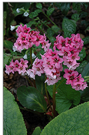
Pink Dragonfly Bergenia flowers