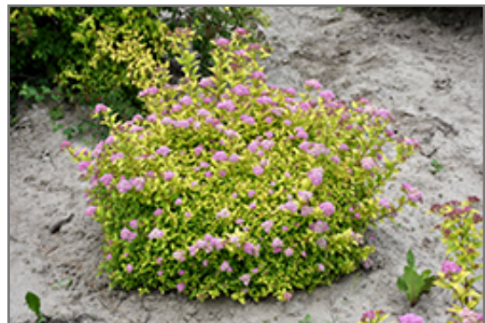
Sundrop Spirea in bloom