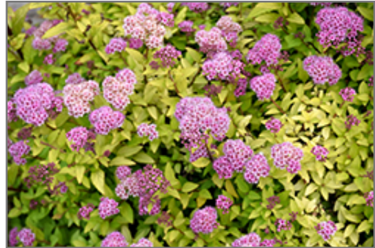
Sundrop Spirea flowers

Sundrop Spirea is recommended for the following landscape applications;