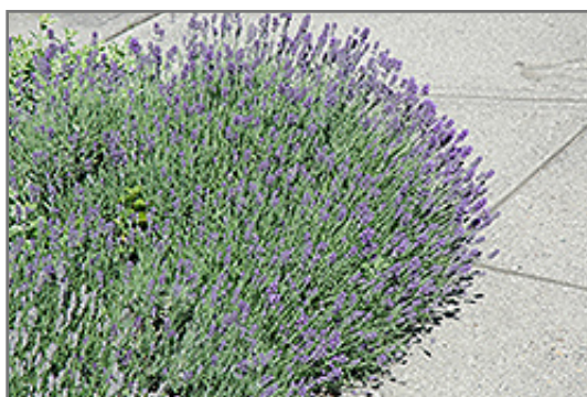
Munstead Lavender in bloom