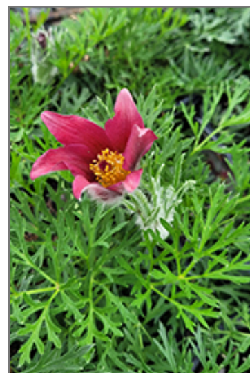
Red Pasqueflower flowers