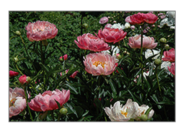
Coral Charm Peony flowers

Coral Charm Peony will grow to be about 30 inches tall at maturity, with a spread of 3 feet. When grown in masses or used as a bedding plant, individual plants should be spaced approximately 30 inches apart. The flower stalks can be weak and so it may require staking in exposed sites or excessively rich soils. It grows at a slow rate, and under ideal conditions can be expected to live for approximately 20 years. As an herbaceous perennial, this plant will usually die back to the crown each winter, and will regrow from the base each spring. Be careful not to disturb the crown in late winter when it may not be readily seen!