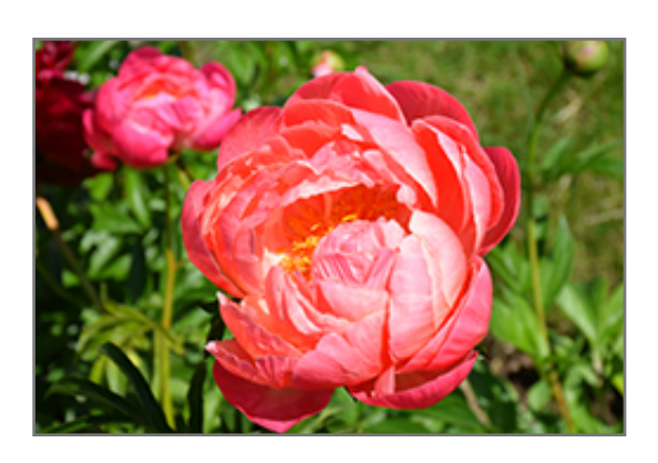
Coral Charm Peony flowers