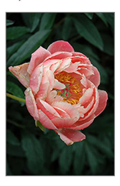
Coral Charm Peony flowers