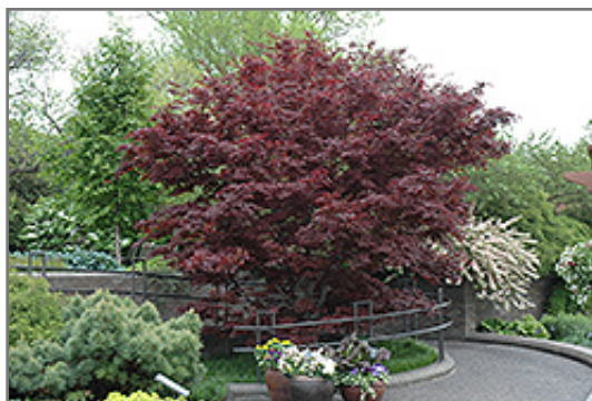
Bloodgood Japanese Maple

Bloodgood Japanese Maple is recommended for the following landscape applications;