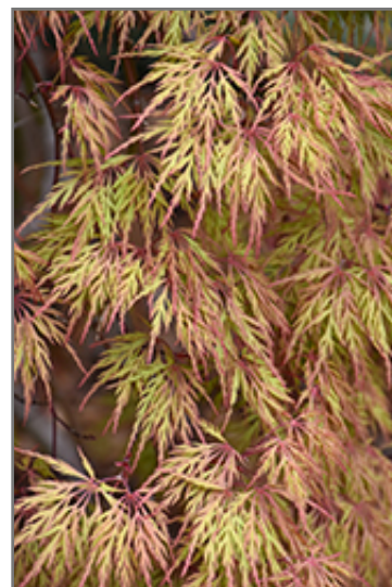
Orangeola Cutleaf Japanese Maple foliage

Orangeola Cutleaf Japanese Maple is recommended for the following landscape applications;