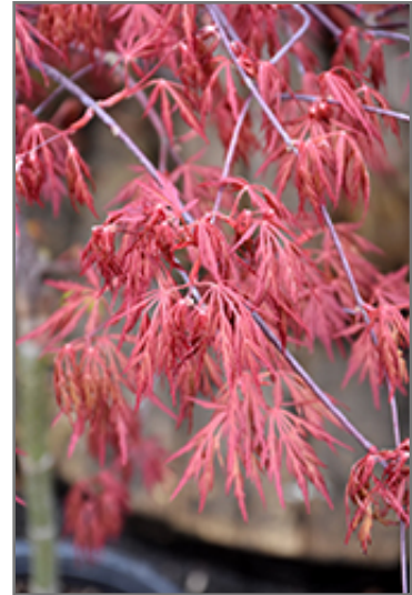
Orangeola Cutleaf Japanese Maple foliage

Orangeola Cutleaf Japanese Maple is a fine choice for the yard, but it is also a good selection for planting in outdoor pots and containers. Because of its height, it is often used as a 'thriller' in the 'spiller-thriller-filler' container combination; plant it near the center of the pot, surrounded by smaller plants and those that spill over the edges. It is even sizeable enough that it can be grown alone in a suitable container. Note that when grown in a container, it may not perform exactly as indicated on the tag - this is to be expected. Also note that when growing plants in outdoor containers and baskets, they may require more frequent waterings than they would in the yard or garden.