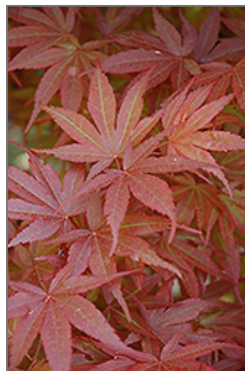
Pixie Dwarf Japanese Maple foliage

Pixie Dwarf Japanese Maple will grow to be about 6 feet tall at maturity, with a spread of 5 feet. It has a low canopy with a typical clearance of 1 foot from the ground, and is suitable for planting under power lines. It grows at a slow rate, and under ideal conditions can be expected to live for 60 years or more.