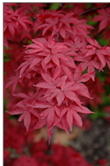
Twombly's Red Sentinel Japanese Maple foliage

Twombly's Red Sentinel Japanese Maple is recommended for the following landscape applications;