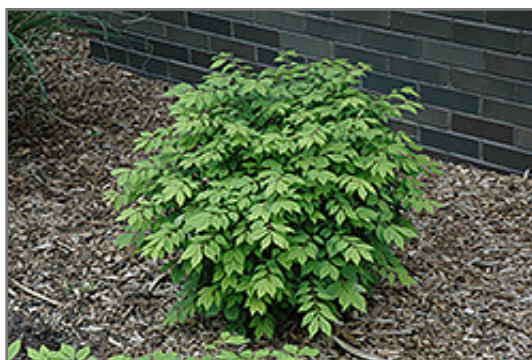
Little Moses Burning Bush