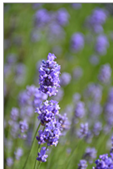
Hidcote Blue Lavender flowers