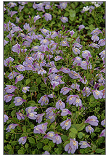
Creeping Mazus flowers