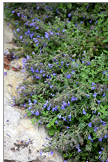
Kit Kat Catmint in bloom