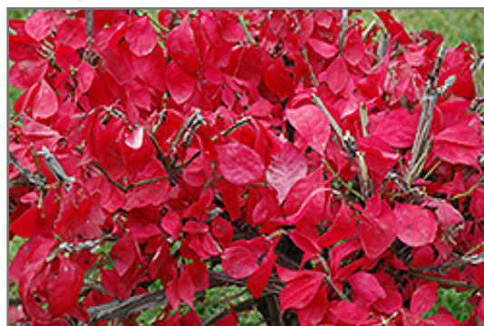
Compact Winged Burning Bush in fall