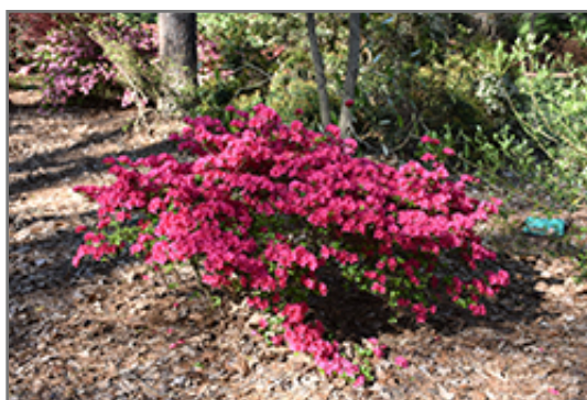
Girard's Fuchsia Evergreen Azalea in bloom