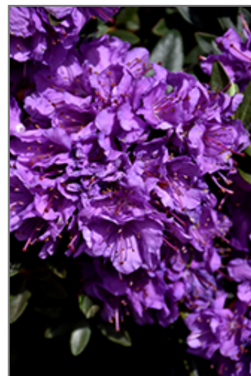
Purple Gem Rhododendron flowers