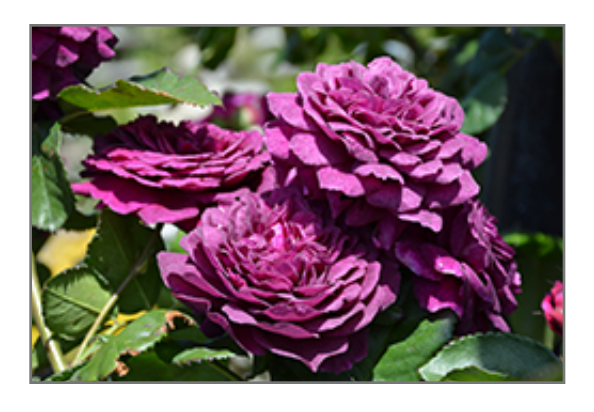
Ebb Tide Rose flowers