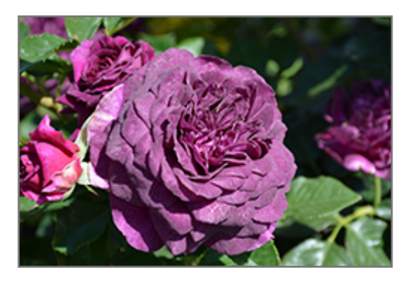
Ebb Tide Rose flowers

Ebb Tide Rose features showy lightly-scented fully double purple flowers with dark red overtones at the ends of the branches from late spring to early fall. The flowers are excellent for cutting. It has dark green deciduous foliage which emerges burgundy in spring. The glossy oval compound leaves do not develop any appreciable fall color.