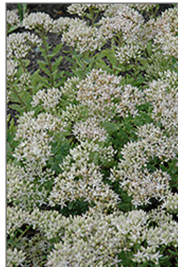
Thundercloud Stonecrop flowers

Thundercloud Stonecrop is a dense herbaceous perennial with a mounded form. Its relatively fine texture sets it apart from other garden plants with less refined foliage.