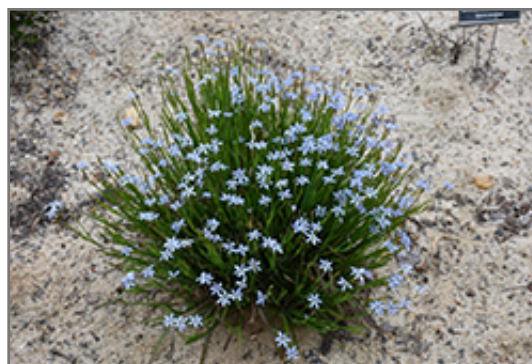
Narrowleaf Blue-Eyed Grass in bloom