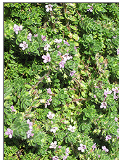
Pink Chintz Creeping Thyme flowers