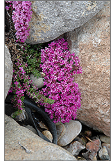
Pink Chintz Creeping Thyme in bloom

This plant should only be grown in full sunlight. It prefers to grow in average to dry locations, and dislikes excessive moisture. It is considered to be drought-tolerant, and thus makes an ideal choice for a low-water garden or xeriscape application. It is not particular as to soil type or pH. It is highly tolerant of urban pollution and will even thrive in inner city environments. Consider covering it with a thick layer of mulch in winter to protect it in exposed locations or colder microclimates. This is a selected variety of a species not originally from North America. It can be propagated by division; however, as a cultivated variety, be aware that it may be subject to certain restrictions or prohibitions on propagation.