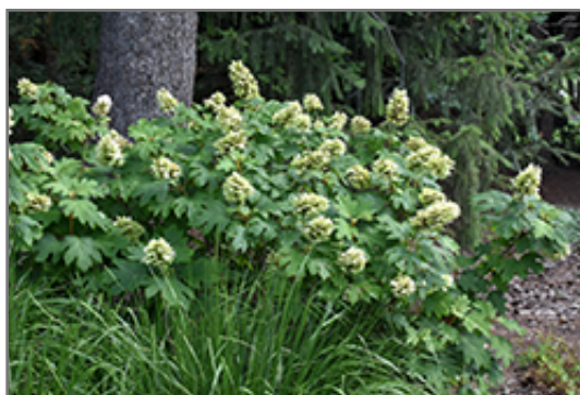
Alice Hydrangea in bloom