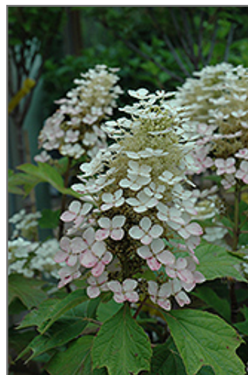
Alice Hydrangea flowers

Alice Hydrangea is recommended for the following landscape applications;