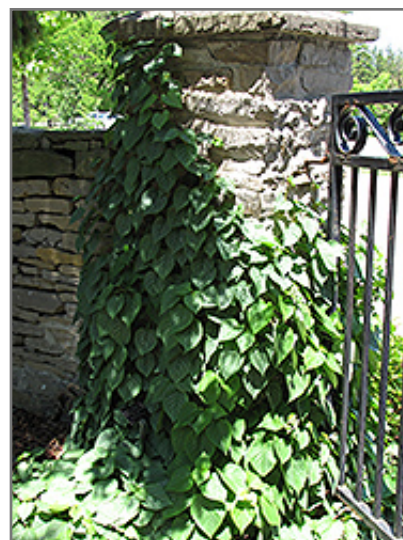
Moonlight Hydrangea Vine