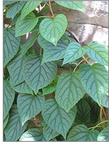
Moonlight Hydrangea Vine foliage

This woody vine performs well in both full sun and full shade. It does best in average to evenly moist conditions, but will not tolerate standing water. It is not particular as to soil pH, but grows best in rich soils. It is somewhat tolerant of urban pollution, and will benefit from being planted in a relatively sheltered location. Consider applying a thick mulch around the root zone in winter to protect it in exposed locations or colder microclimates. This is a selected variety of a species not originally from North America.