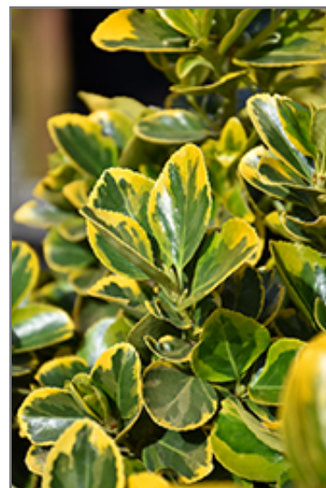
Gold Variegated Japanese Euonymus foliage

Gold Variegated Japanese Euonymus is recommended for the following landscape applications;