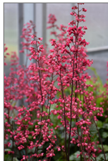
Paris Coral Bells flowers