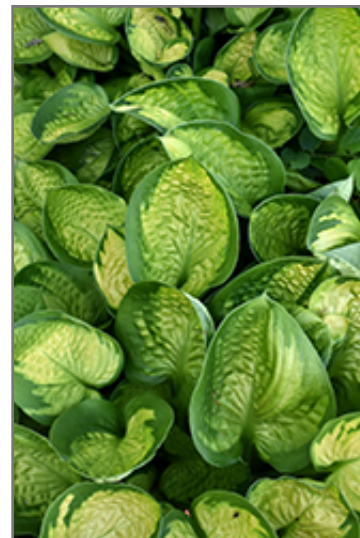
Rainforest Sunrise Hosta foliage

Rainforest Sunrise Hosta is recommended for the following landscape applications;