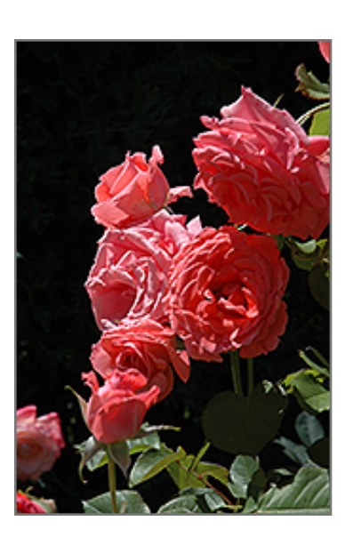
Climbing America Rose flowers