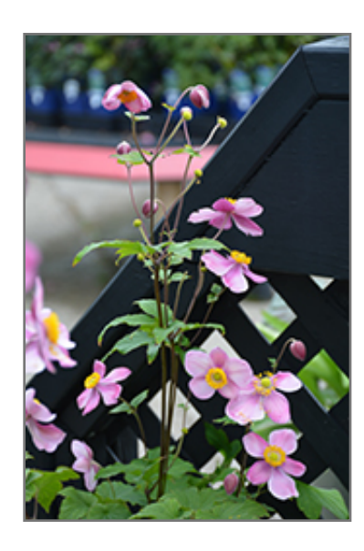
September Charm Anemone flowers

This plant does best in full sun to partial shade. It prefers to grow in average to moist conditions, and shouldn't be allowed to dry out. It is not particular as to soil type or pH. It is somewhat tolerant of urban pollution. Consider applying a thick mulch around the root zone in winter to protect it in exposed locations or colder microclimates. This particular variety is an interspecific hybrid. It can be propagated by division; however, as a cultivated variety, be aware that it may be subject to certain restrictions or prohibitions on propagation.