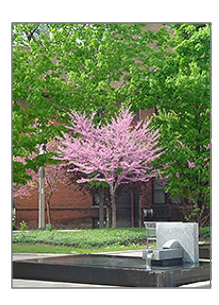
Eastern Redbud (tree form) in bloom

Eastern Redbud (tree form) is recommended for the following landscape applications;