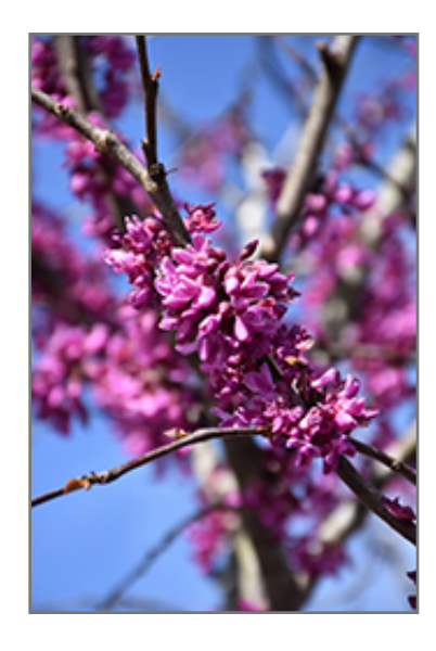
Eastern Redbud (tree form) flowers