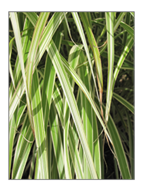
Morning Light Maiden Grass foliage

This plant does best in full sun to partial shade. It prefers to grow in average to moist conditions, and shouldn't be allowed to dry out. It is not particular as to soil type or pH. It is highly tolerant of urban pollution and will even thrive in inner city environments. This is a selected variety of a species not originally from North America. It can be propagated by division; however, as a cultivated variety, be aware that it may be subject to certain restrictions or prohibitions on propagation.