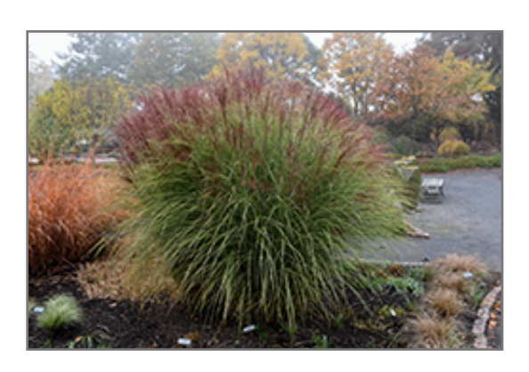
Morning Light Maiden Grass fruit

Morning Light Maiden Grass is recommended for the following landscape applications;