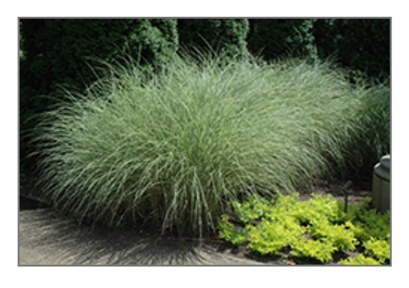
Morning Light Maiden Grass