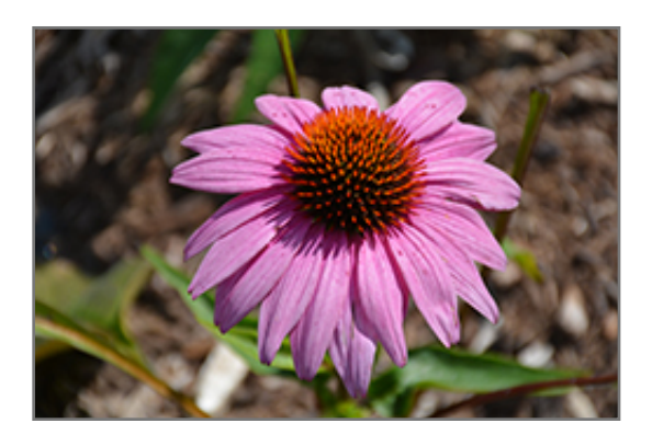
Prairie Splendor Coneflower flowers