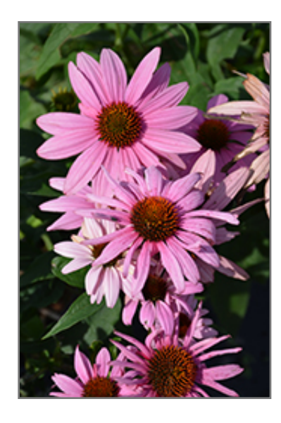
Prairie Splendor Coneflower flowers

This is a relatively low maintenance plant, and is best cleaned up in early spring before it resumes active growth for the season. It is a good choice for attracting birds and butterflies to your yard, but is not particularly attractive to deer who tend to leave it alone in favor of tastier treats. It has no significant negative characteristics.