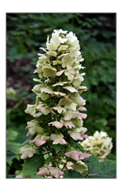
Munchkin Hydrangea flowers

This shrub performs well in both full sun and full shade. It prefers to grow in average to moist conditions, and shouldn't be allowed to dry out. It is not particular as to soil type or pH. It is somewhat tolerant of urban pollution, and will benefit from being planted in a relatively sheltered location. Consider applying a thick mulch around the root zone in winter to protect it in exposed locations or colder microclimates. This is a selection of a native North American species.