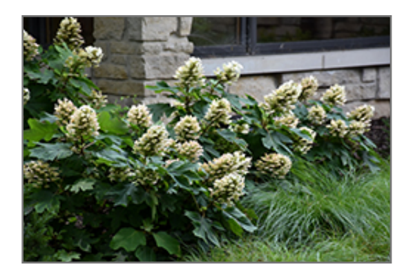
Munchkin Hydrangea flowers