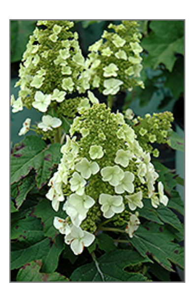
Munchkin Hydrangea flowers

Munchkin Hydrangea is recommended for the following landscape applications;