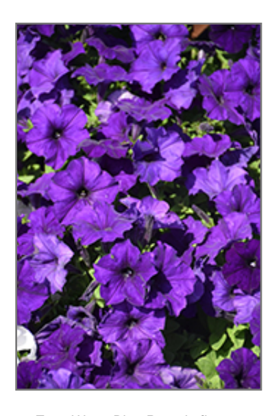
Easy Wave Blue Petunia flowers

Easy Wave Blue Petunia is a dense herbaceous annual with a trailing habit of growth, eventually spilling over the edges of hanging baskets and containers. Its medium texture blends into the garden, but can always be balanced by a couple of finer or coarser plants for an effective composition.