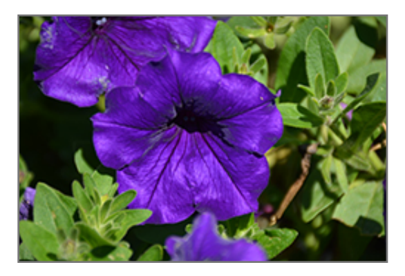
Easy Wave Blue Petunia flowers