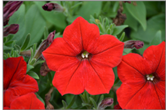
Easy Wave Red Petunia flowers

Easy Wave Red Petunia is a dense herbaceous annual with a trailing habit of growth, eventually spilling over the edges of hanging baskets and containers. Its medium texture blends into the garden, but can always be balanced by a couple of finer or coarser plants for an effective composition.