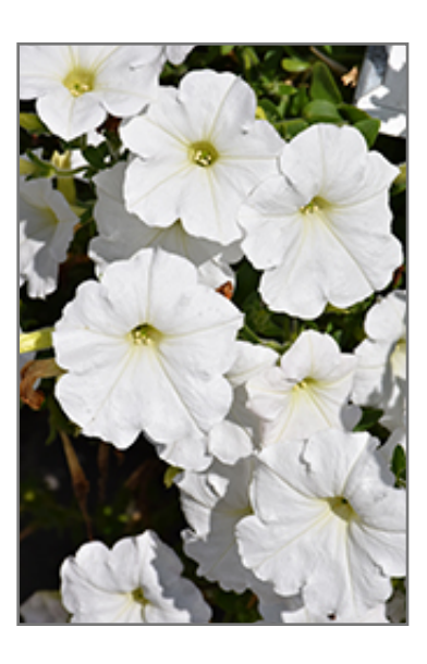
Easy Wave White Petunia flowers

Easy Wave White Petunia is a dense herbaceous annual with a trailing habit of growth, eventually spilling over the edges of hanging baskets and containers. Its medium texture blends into the garden, but can always be balanced by a couple of finer or coarser plants for an effective composition.