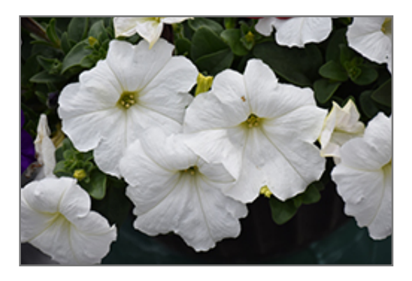
Easy Wave White Petunia flowers