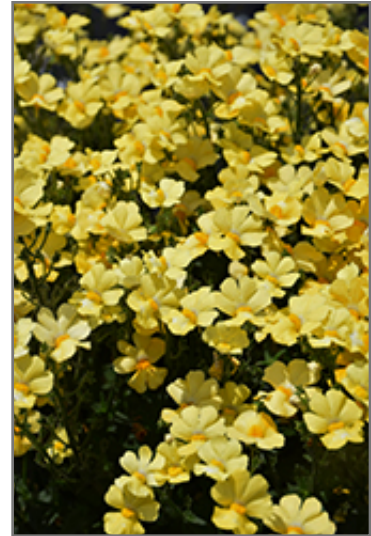
Sunsatia Lemon Nemesia flowers