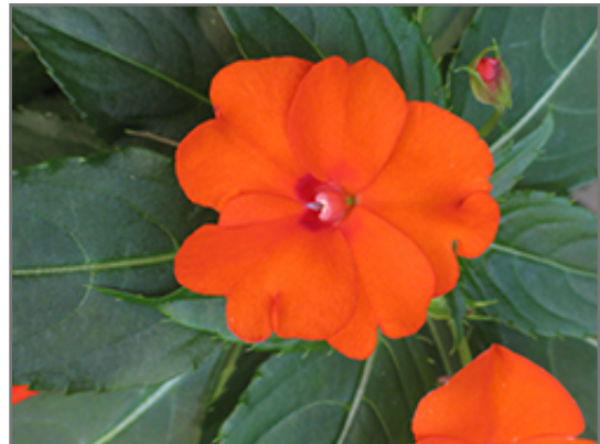
Infinity Orange New Guinea Impatiens flowers

This plant will require occasional maintenance and upkeep, and should not require much pruning, except when necessary, such as to remove dieback. It has no significant negative characteristics.