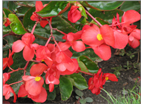
Dragon Wing Red Begonia flowers

Dragon Wing Red Begonia is an herbaceous annual with a trailing habit of growth, eventually spilling over the edges of hanging baskets and containers. Its medium texture blends into the garden, but can always be balanced by a couple of finer or coarser plants for an effective composition.