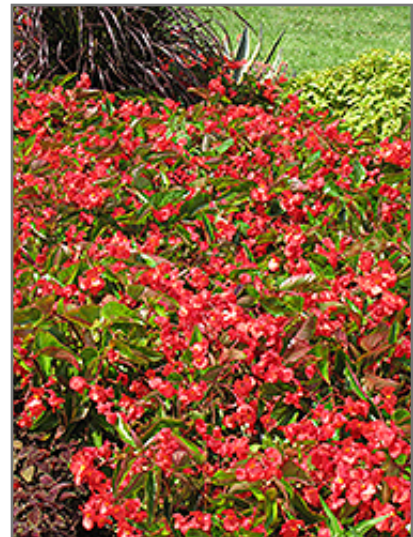
Dragon Wing Red Begonia in bloom