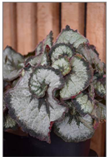
Escargot Begonia foliage