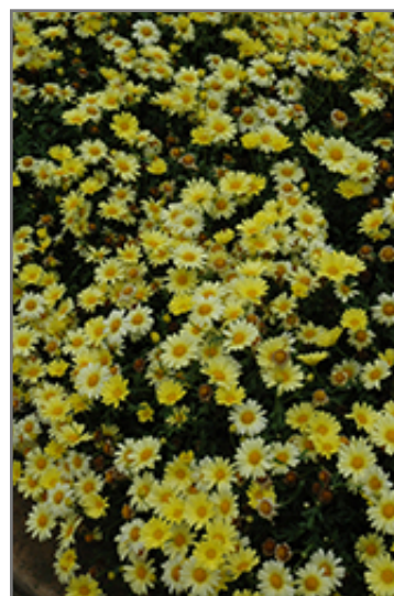
Butterfly Marguerite Daisy flowers