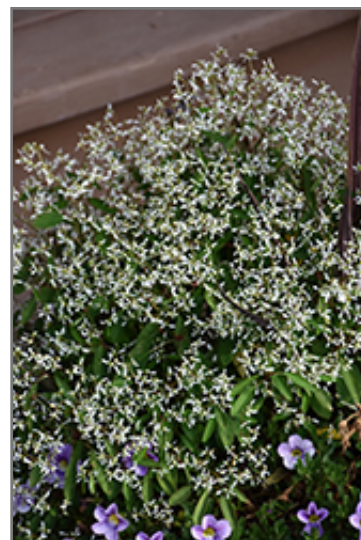
Breathless White Euphorbia flowers