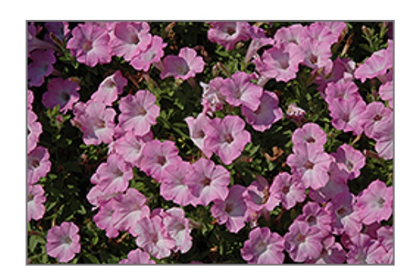
Supertunia Pink Charm Petunia flowers