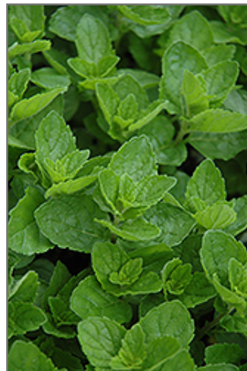
Spearmint foliage