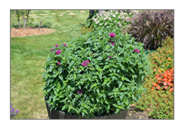
Pardon My Purple Beebalm in bloom

This plant will require occasional maintenance and upkeep, and should be cut back in late fall in preparation for winter. It is a good choice for attracting bees, butterflies and hummingbirds to your yard, but is not particularly attractive to deer who tend to leave it alone in favor of tastier treats. Gardeners should be aware of the following characteristic(s) that may warrant special consideration;