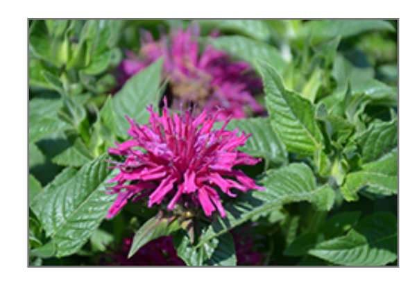
Pardon My Purple Beebalm flowers

Pardon My Purple Beebalm is an herbaceous perennial with a mounded form. Its medium texture blends into the garden, but can always be balanced by a couple of finer or coarser plants for an effective composition.